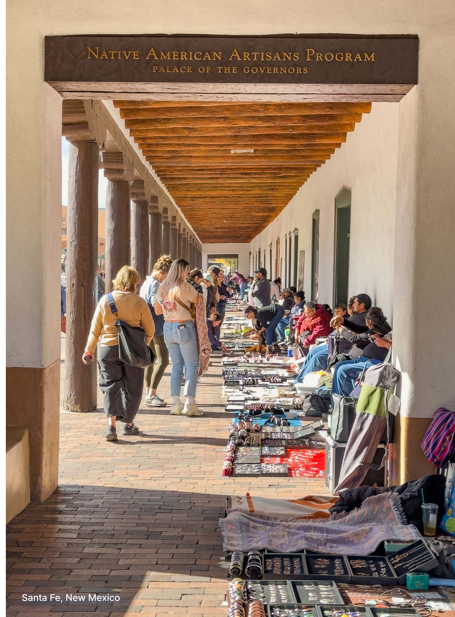
Santa Fe, New Mexico