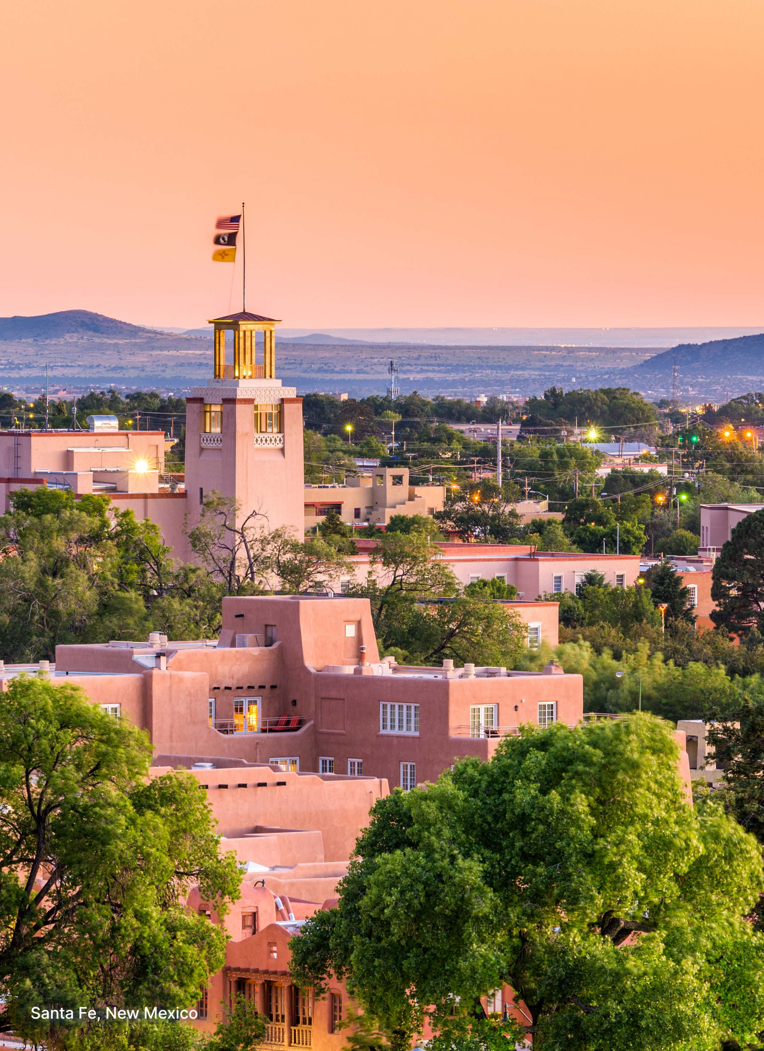
Santa Fe, New Mexico